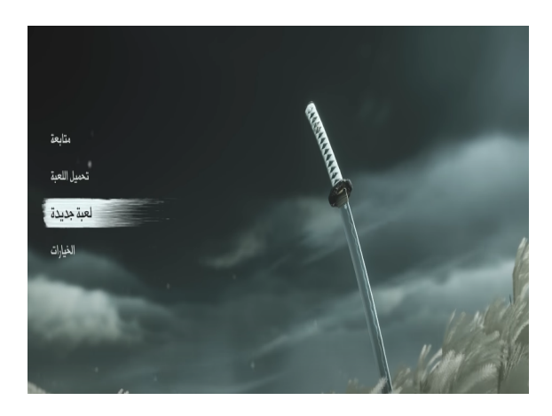
Figure 5-B. Localized Arabic version of Ghost of Tsushima (2020)

In Figure 5-A above, the English menu items are aligned to the left. However, Figure 5-B below shows this alignment is duplicated for the Arabic version's layout and text alignment.