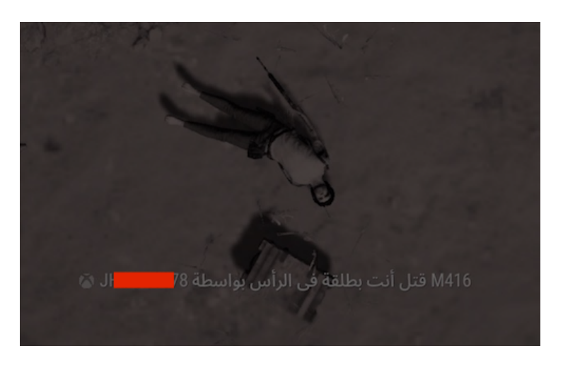
Figure 1. Incorrect display of Arabic BiDi text taken from PlayerUnknown's Battlegrounds (2017) on Xbox One

Most often, Arabic is written and read from right to left; however, in certain contexts, some parts inside a sentence are written and read from left to right. Such cases include sentences with numbers and Latin texts, which are common in video games. This aspect makes Arabic a bi-directional (BiDi) language, and Arabic texts in any localized software should also reflect this characteristic. Several video games do not support BiDi, thereby posing difficulties for their corresponding Arabic versions. This complication becomes serious when numbers, Latin words, and certain signs are found in one line or sentence. The following example is taken from PlayerUnknown's Battlegrounds (2017) on Xbox One. When the player dies, a message pops up saying "[X] player killed with [X weapon]", where the screen name of the player and weapon type are presented in English inside the Arabic sentence.