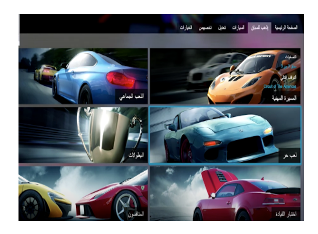
Figure 6-B. Forza 6 (2015) Arabic mirrored menu

The Arabic version of Forza 6 (2015) provides an excellent example of how video games should be mirrored when localized into Arabic (Figure 6-B). As can be seen in Figure 6-B, the whole interface and texts are right-aligned, which makes the game look and feel Arabic.