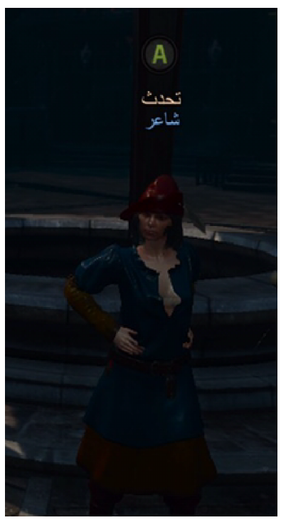
Figure 7-B. Screenshot of NPC from the Arabic version of The Witcher 3 (2015)