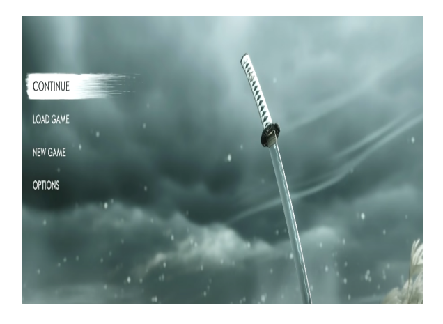
Figure 5-A. Original English version of Ghost of Tsushima (2020)

A UI layout also includes text alignment, and in Arabic specifically the ingame text should be right-aligned. The recent video game Ghost of Tsushima (2020) includes Arabic localization; however, the game does not support Arabic RTL orientation or UI layout. Consider figures 5-A and 5-B.