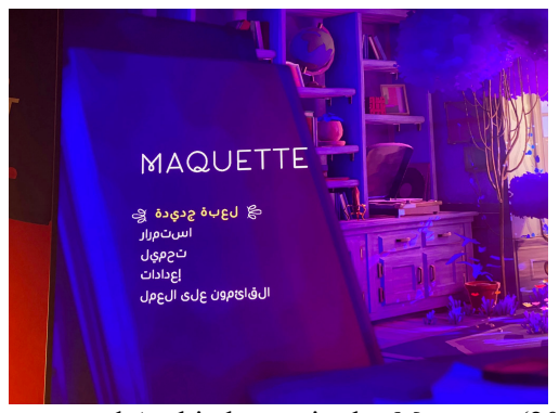
Figure 4-A. Disconnected Arabic letters in the Maquette (2021) main menu

This issue of disconnected Arabic letters becomes more serious and disruptive when the video game includes subtitles for the voiceover. Recently, Graceful Decay's Maquette (2021) was released with disconnected Arabic script in the main menu and the subtitles (See figures 4-A and 4-B).