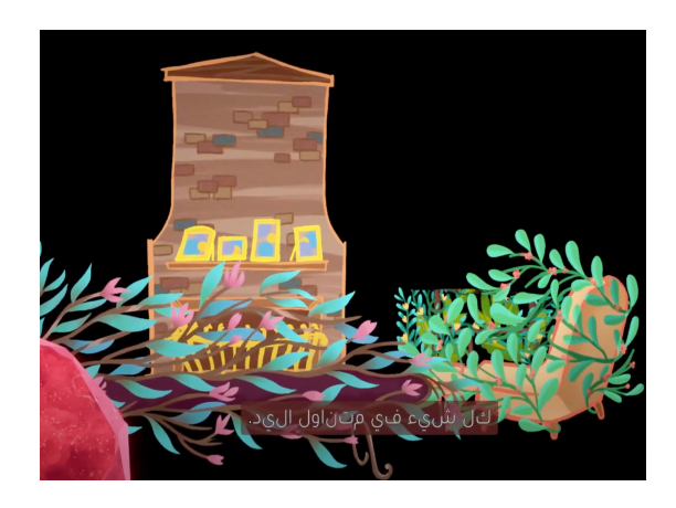
Figure 4-B. Disconnected Arabic letters in the Maquette (2021) subtitles

Such issues negatively impact video game sales in the target market and also hinder playability, which is, as Bernal-Merino (2020, p. 299) states, a key quality metric of video game localization.