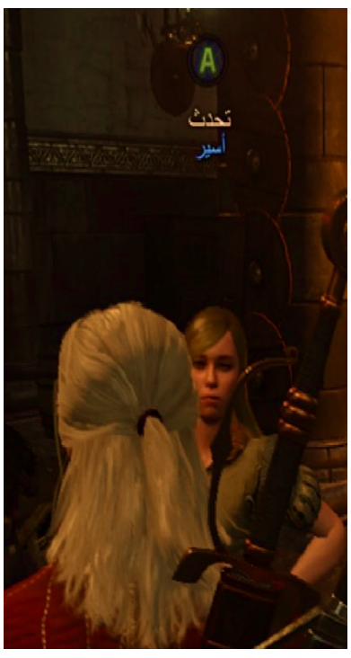
Figure 7-A. Screenshot of NPC from the Arabic version of The Witcher 3 (2015)

When rendered into Arabic, the above titles have been gendered as male, resulting in awkward translations when these titles appear above a female NPC (See figures 7-A and 7-B).