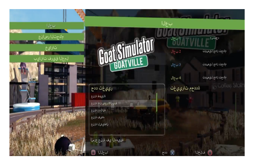
Figure 3-A. Disconnected Arabic letters in Goat Simulator (2015)

Due to menu items with either disconnected letters or disconnected letters and wrong text directionality, Arab gamers would have difficulty reading ingame texts. Recently, Arab ROM-hackers fixed Goat Simulator (2015) and made it available with the correct script and layout (See Figure 3-B).