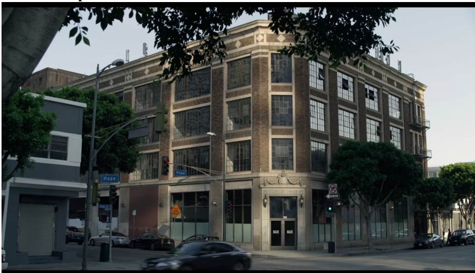
Figure 6. Screenshot of Velvet Buzzsaw with an example of potentially salient but liminal VVC

In the above shot, lasting a little over 3 seconds, one can notice two very small blue street signs giving the name of the street "Hope" in white. We wish to argue that this case of VVC will be positioned at the far end of the "ostensiveness" cline, with a very small portion of the audience allocating visual attention to the name. Similarly, we posit its plot relevance is far from unambiguous. At the same time, it can hardly be argued that the name is random, i.e. that it "just happened to be in the shot". To begin with, "Hope" does not seem a very standard street name, although in downtown LA there in fact is South Hope Street. It is actually possible that the scene was shot in that particular location as the Google street view suggests this would be 1202 Hope Street, but still this does not seem to be an entirely incidental but rather conscious decision made by the filmmakers (as an element of mise-en-scène that has a symbolic meaning – cf. Bordwell & Thompson, 2010, Chapter 4). What is more, the intentional character of the street name seems to be