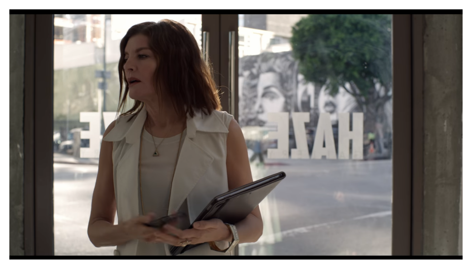
Figure 7. Screenshot of Velvet Buzzsaw with an example of potentially salient but less ostensive VVC

corroborated by the insertion of another visual-verbal element which simply cannot be deemed accidental in this shot – two inscriptions of "HAZE" placed on the door, stating the name of the art gallery in which the subsequent conversation is held between Morf and Rhodora (Haze), the gallery's owner. Notably, in an earlier scene shot from the inside of the gallery we see Rhodora enter the building through this door with the name of the gallery being visible (see Fig. 7).