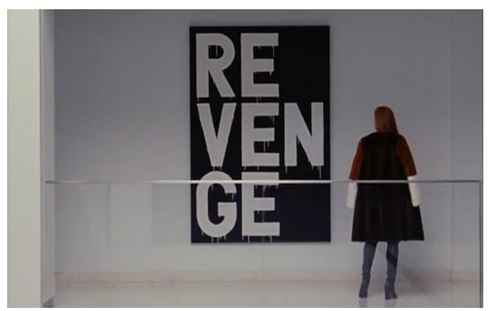
Figure 1. Screenshot of Nocturnal Animals with an example of optimally ostensive VVC