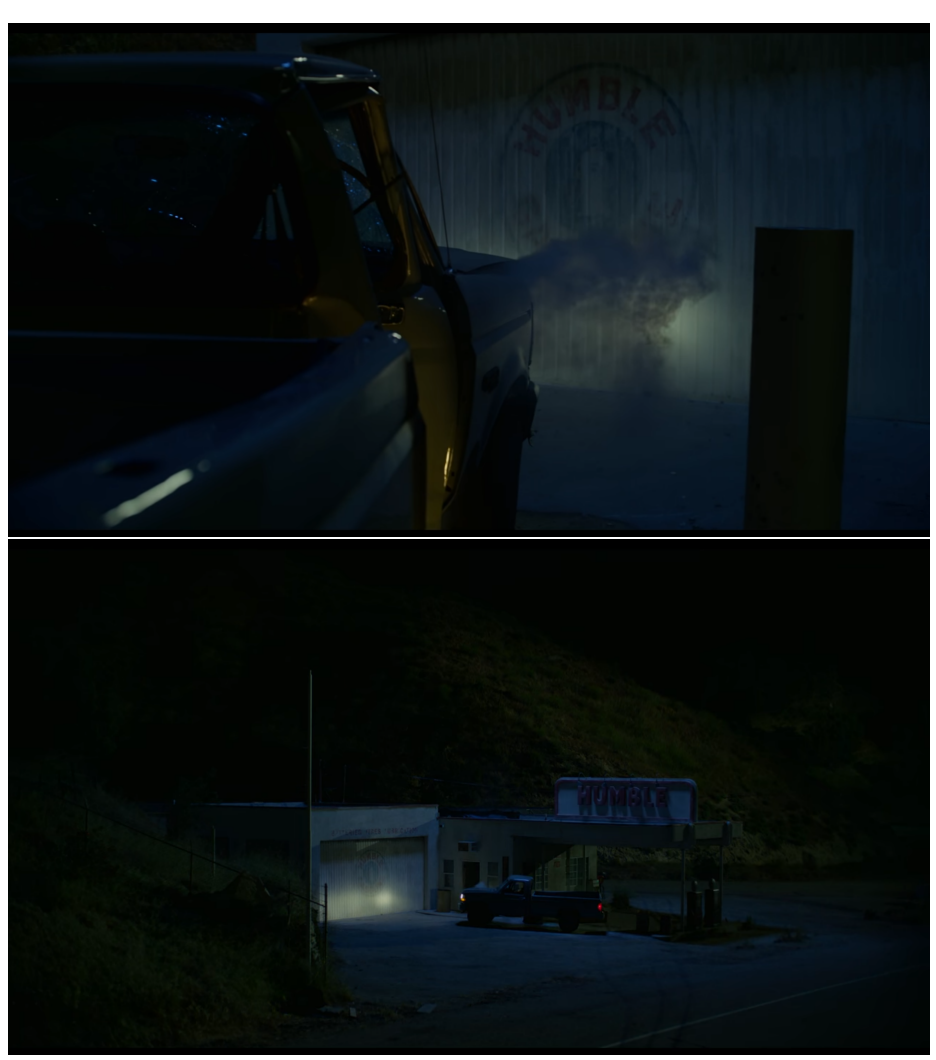
Figures 3-5. Screenshots of Velvet Buzzsaw with an example of salient but less ostensive VVC

When it comes to plot relevance, it is here less ascertainable than in Case 1 and more generally, the use of this VVC is somewhat reminiscent of the example of the "REVENGE" painting found in the film Nocturnal Animals discussed above.