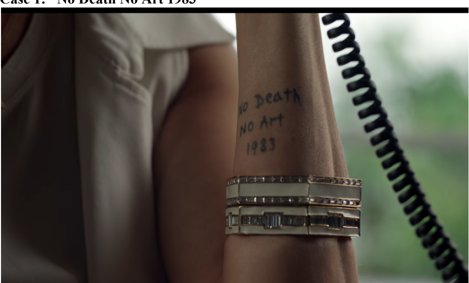
Case 1: "No Death No Art 1983"

The examples will later on be again referred to as they were also used in the empirical component of this paper. In that sense, the observations formulated in the following analysis will serve as a basis for hypotheses tested in the reception study we report in the second part of the article.